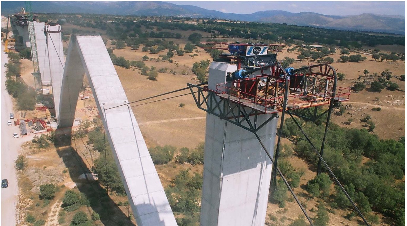
▲ Half-arches during lowering operation

Heavy lifting, supply of bearings and post-tensioning works.