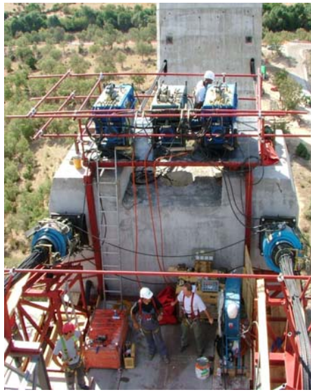
▲ Heavy lifting equipments on pylon head

For this reason it was necessary to install two additional cables of